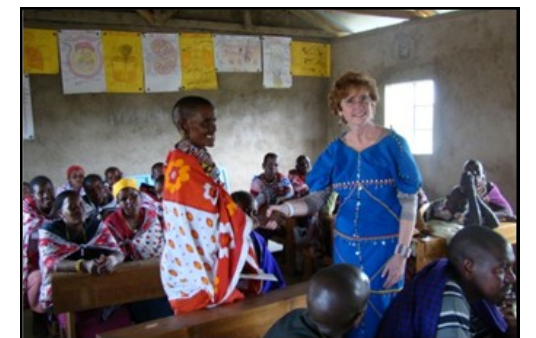
Tribal meeting in one of the classrooms where we discussed the importance of education (the women made me the blue dress I am wearing).