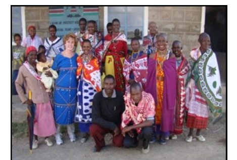
Outside the school with the Maasai women, head teacher and pastor.