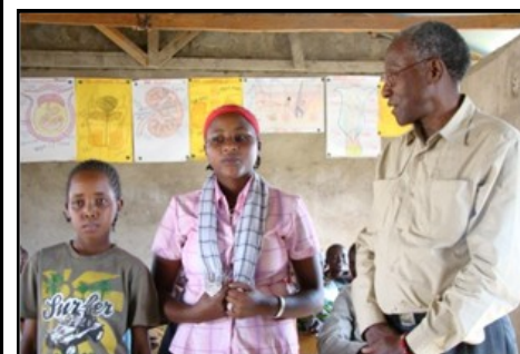
The girl in the pink shirt had just completed 8 th grade and was telling me in English that she wanted to go to high school and then on to college so she could become an optician.