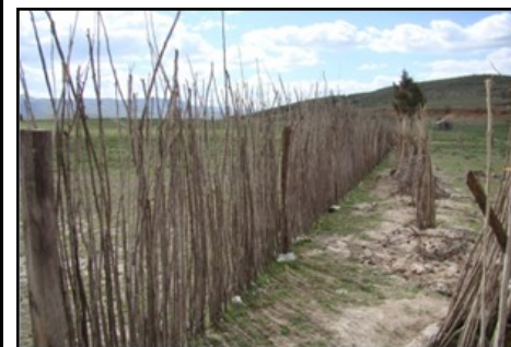
Fence made of wood posts, wire and branches - it surrounds the school and other outbuildings.